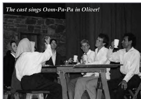
The cast sings Oom-Pa-Pa in Oliver!

Another delightful musical production by Kimberton Hills debuted on the Rose