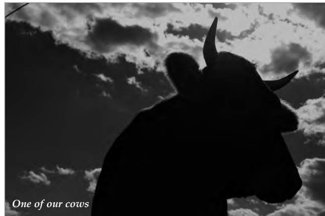
One of our cows