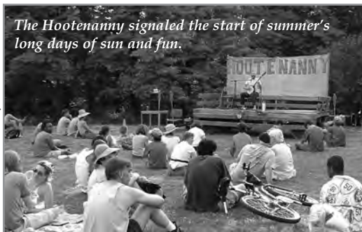
The Hootenanny signaled the start of summer's long days of sun and fun.

On June 9, we kicked off the summer with the annual Hootenanny, a festival of music and food. There was a great crowd here in the village to hear folk and bluegrass music by local musicians, try some delicious food from our café and enjoy the children's activities including water games, face painting and pony rides.