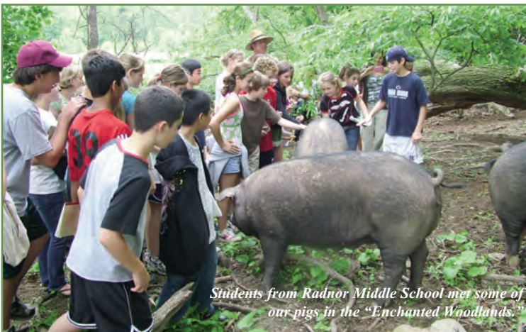
Students from Radnor Middle School met some of our pigs in the "Enchanted Woodlands."

We have been enjoying our connections with the local community. The Radnor Middle School Watershed Program returned for a study of the village and we welcomed the third grade from East Pikeland Elementary