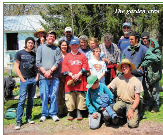
The garden crew

with floor radiant heat, repairing the CSA Hritz barn, creating connecting roads within the farm complex, enriching the soil fertility and the purchase of additional farm equipment.