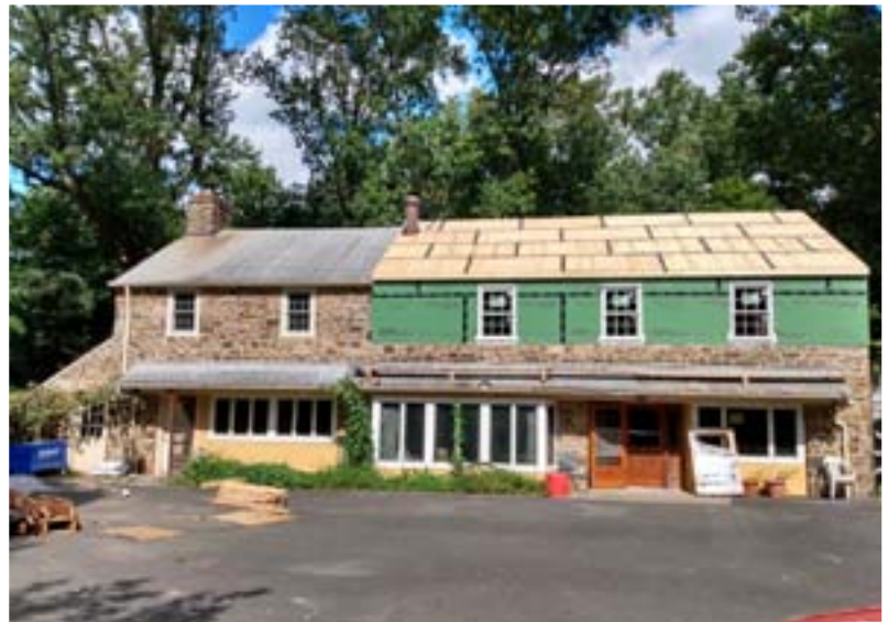
Recent renovations began this summer at Kerria House

In April 2019, the house was vacated and the community made the decision to renovate it. After several conversations and design considerations we began construction. The roof came off! Now the second floor has full height walls and a small space for a family. The kitchen is brand new and all of the floors got attention. Three bathrooms were renovated. Insulation was improved and air conditioning was added. New windows and a new roof complete the updates.