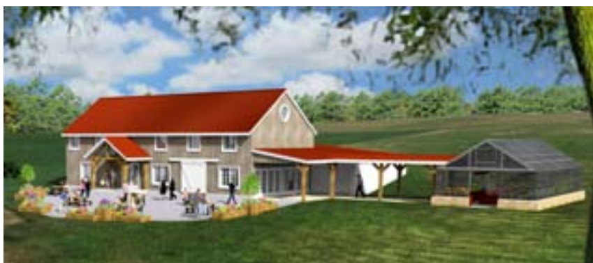
The future Cliff and Catherine Todd Sankanac CSA Building