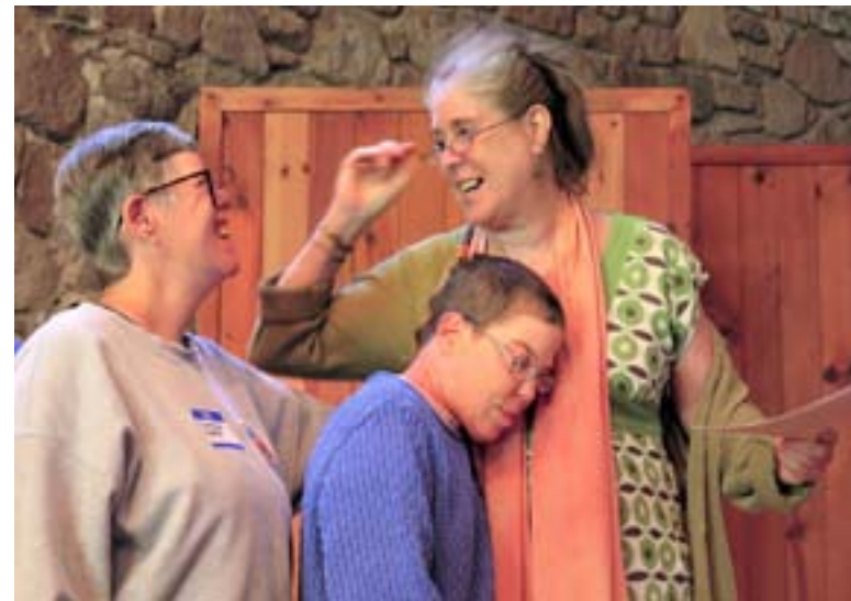
Smiling faces on Friends and Family Day in CVKH