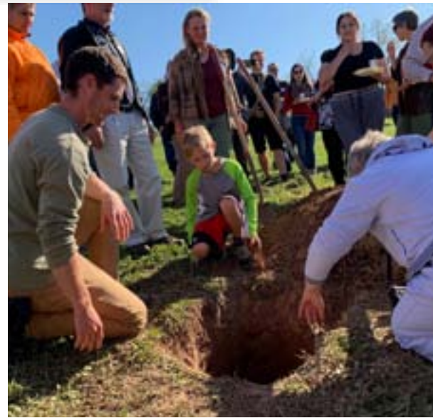
Friends and neighbors gathered at the Ground Blessing ceremony for the new CSA building on Oct. 5th