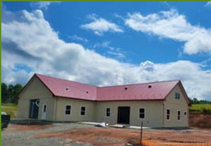
Progress is continuing on our new Cliff & Catherine Todd CSA Building!