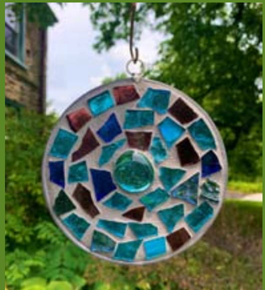
Hanging mosaic art pieces are new to our Online Craft Shop! Available at: www.camphillkimberton.org

Volunteer Opportunities Available! Interested in joining our vibrant life-sharing community? Learn more and apply on our website: www.camphillkimberton.org