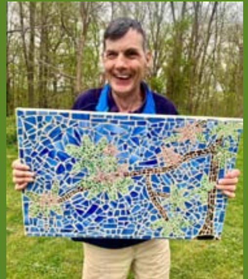
Creating projects in the Kimberton Hills Mosaic Studio