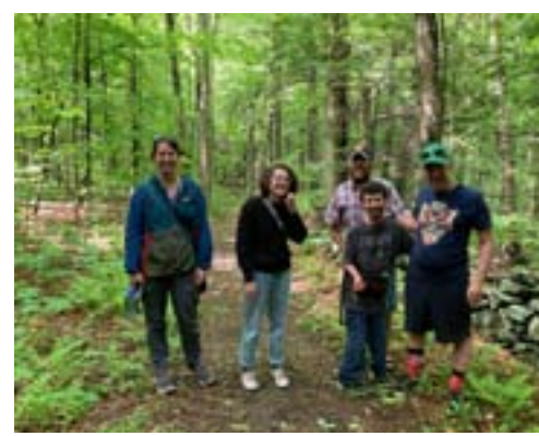
Kerria House's vacation to the Berkshires. Hikes included Hawley Bog and Shelburne Falls (above & below)