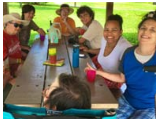
The CVKH Herb Garden's recent trip to Valley Forge National Historic Park (above & below)