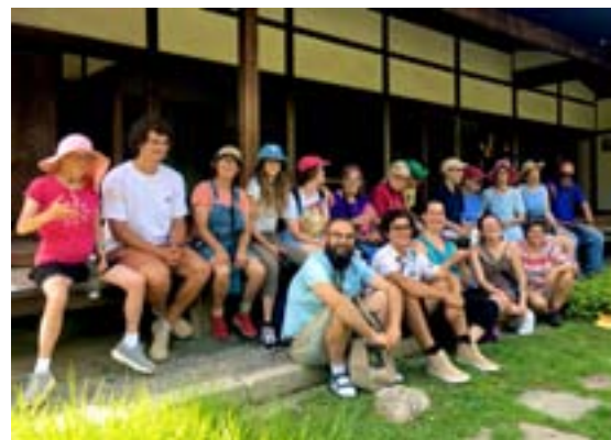
The Adult Education group has been studying Japan this year and recently took a trip to Shofuso Gardens in Philadelphia