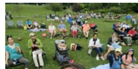
Pfeiffer House enjoying the summer concert at Kimberton Park