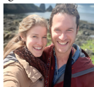
Engagement Party: "The Shoe Game" answering questions to reveal how compatible we are.